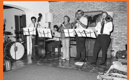
Will this "ensemble extraordinaire" make an appearance at Reunion Weekend 2009?