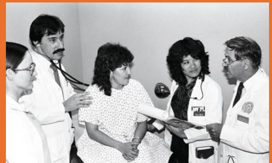
Do you know what your clinical rotation classmates are up to?

You'll find out the answers to these and other burning questions at Reunion Weekend 2009. Block your calendars and plan to attend the festivities in San Antonio from October 15-17. The Office of Alumni Relations will be mailing more information about Reunion Weekend in the weeks ahead. For more details, go to http://www.SAMedAlum.com .